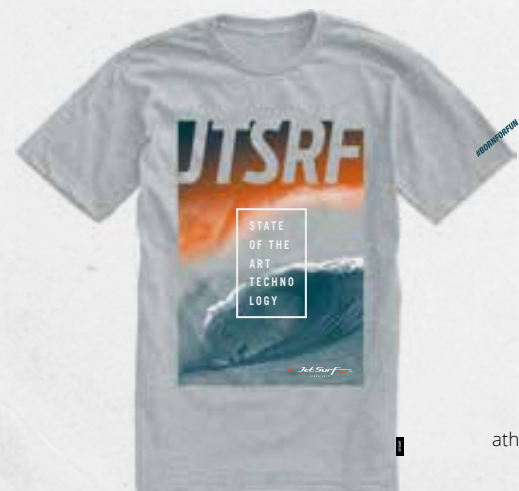
T-SHIRT WAVE colour athletic heather / white