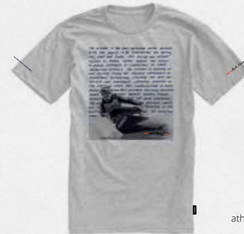
T-SHIRT TEXT colour athletic heather / white