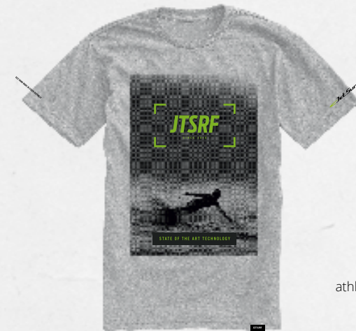
T-SHIRT TURN colour athletic heather, lime / black, orange