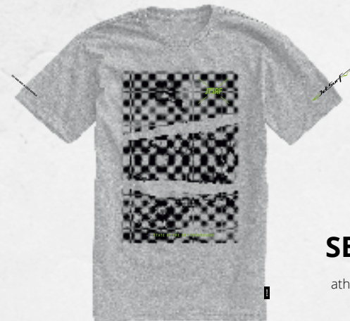
T-SHIRT SEQUENCE colour athletic heather / white