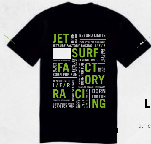
T-SHIRT LETTERS colour black, lime / athletic heather, orange